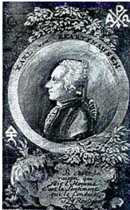
Karl von Eckhartshausen (1752-1803)

Published in six parts in the periodical "The Unknown World", 1895.